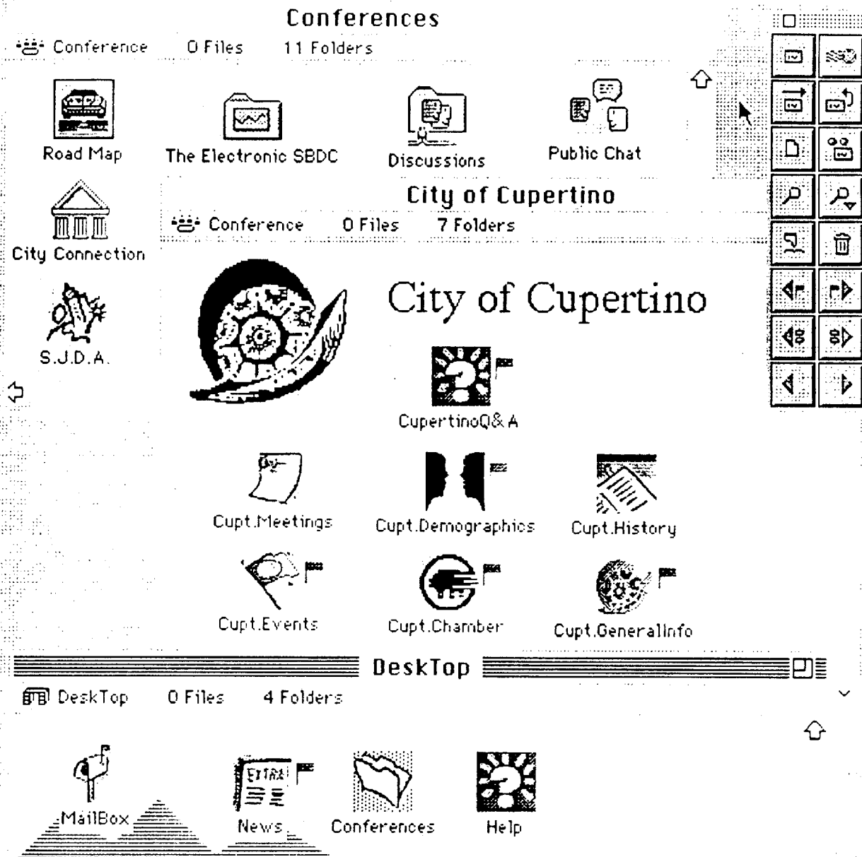
Figure 3: Client software (First Class) for Cupertino City Net

With many sectors in education, society, business, and government pushing for broadband connections and communications pipes the users who are teething on our text-based systems will demand and eventually receive information systems that can deliver sound, reliable and secure transactional information, full motion digital video, and high resolution images for use in purchasing goods, making medical diagnoses, and for pure entertainment. It is unclear how the community networks of today, which have not found stable funding models yet, will meet that challenge.